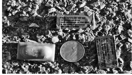
FIGURE 1. Photo of ONRAB ® rabies vaccine-baits.

Here, we report on field trials designed to determine the efficacy of AdRG1.3, hereafter called ONRAB ® , in baits, for immunizing free-ranging skunks and raccoons against rabies in SW Ontario. The